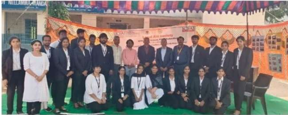
DECCAN NEWS SERVICE RANGAREDDY

The Legal Aid Society of ICFAI Law School, IFHE, Hyderabad, organized an impactful Legal Awareness Program dedicated to safeguarding the rights of senior citizens. The event was held at the Mandal Parishad Primary School in Athvelly Village, focusing on promoting legal knowledge and welfare for the elderly.