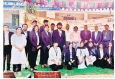
Participants at the Legal Awareness Programme organised by Legal Aid Society of ICFAI Law School at Athvelly village in RR district on Saturday

The event underscored the commitment of ICFAI Law School's Legal Aid Society to advocate for senior citizens' rights, promoting legal literacy and ensuring the well-being of the elderly in the community.