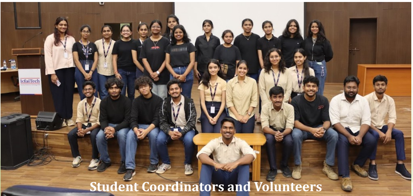
Student Coordinators and Volunteers