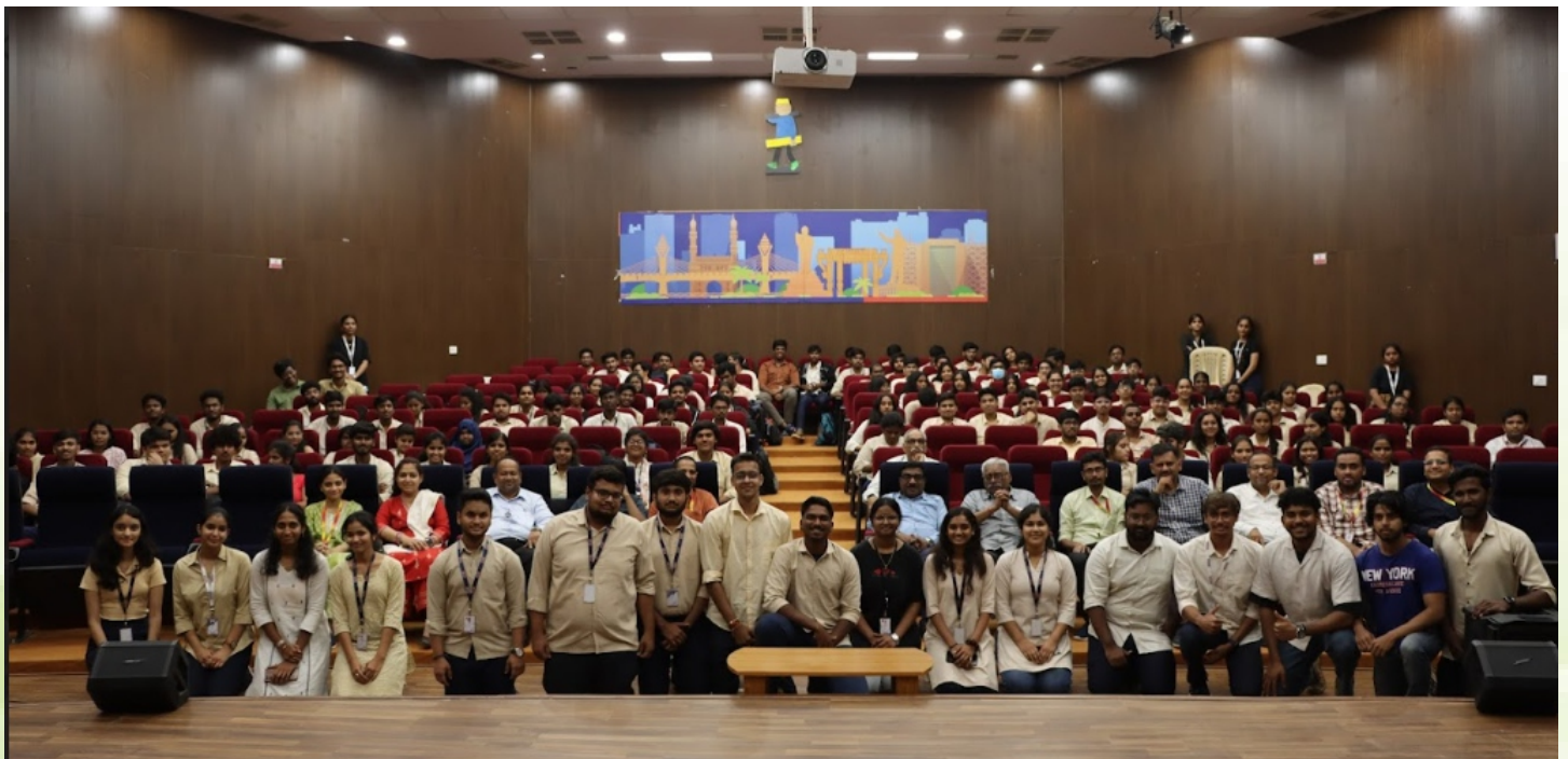
Winner of Software & Hardware with the Jury and dignitaries