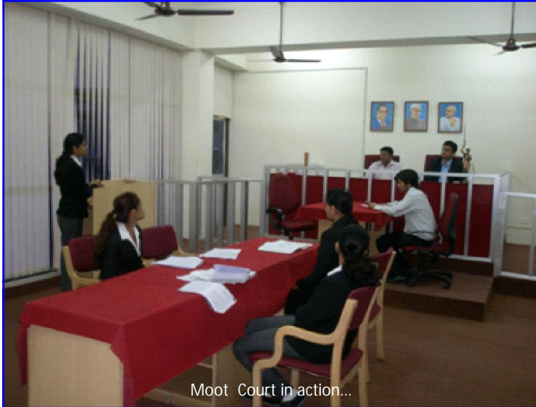
Moot Court in action...