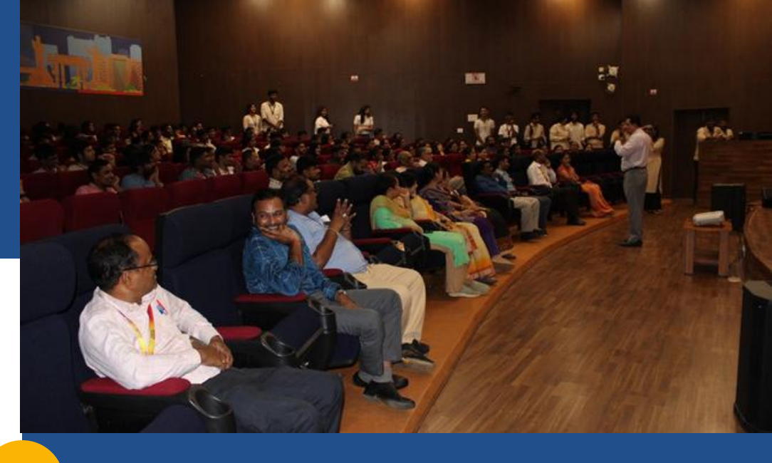
Spotlit Club played a wonderful skit, it was a fun to watch them.