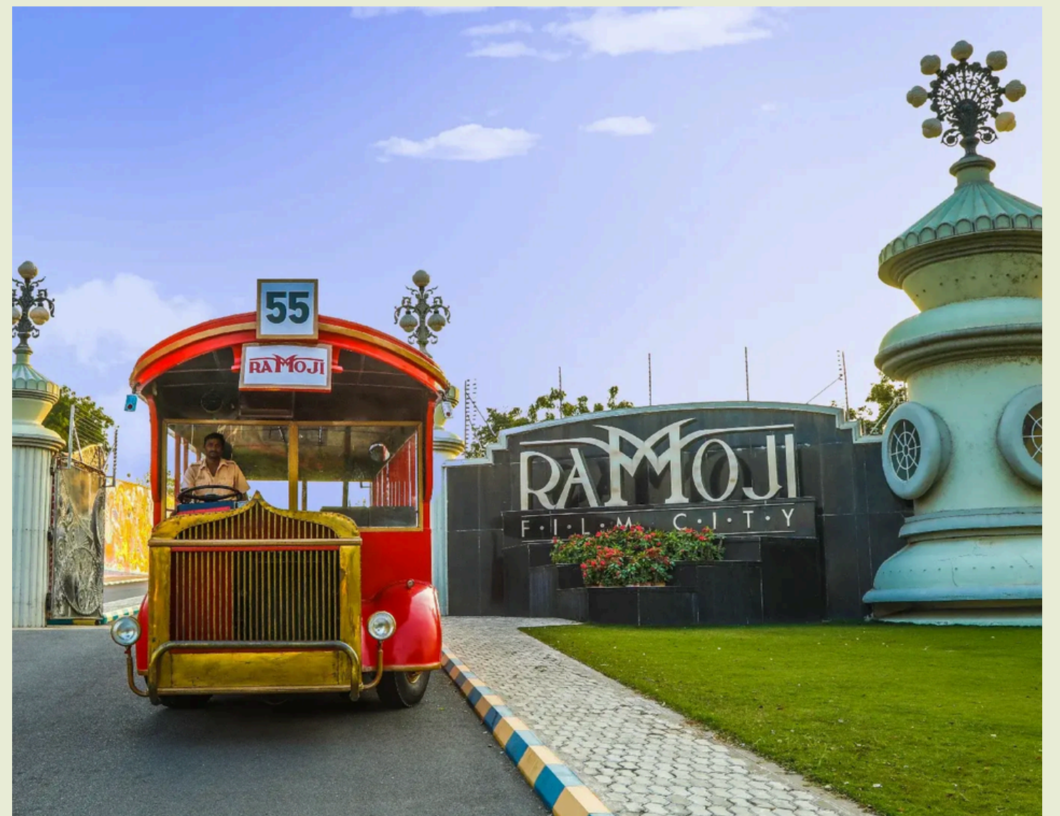
Ramoji Film City