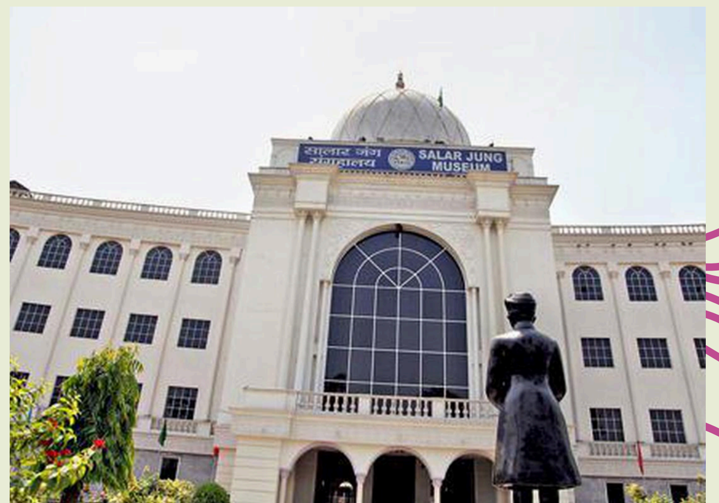
Salar Jung Museum