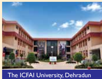
The ICFAI University, Dehradun