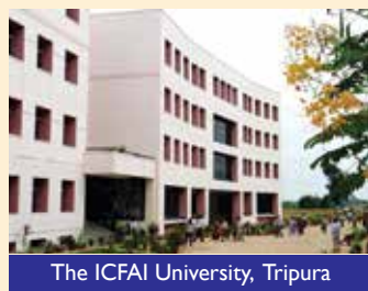
The ICFAI University, Tripura