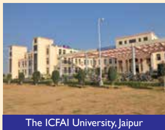
The ICFAI University, Jaipur