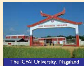
The ICFAI University, Nagaland