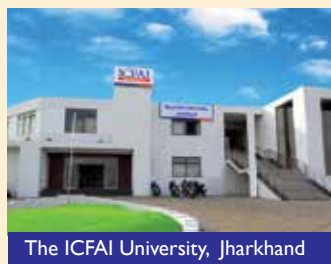
The ICFAI University, Jharkhand