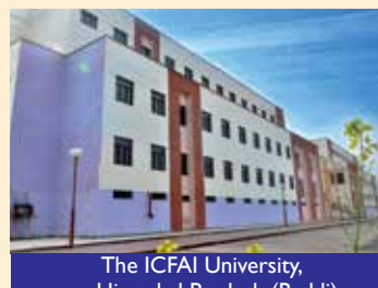
The ICFAI University, Himachal Pradesh (Baddi)