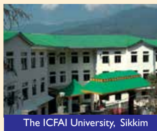
The ICFAI University, Sikkim