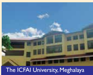
The ICFAI University, Meghalaya