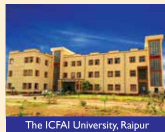
The ICFAI University, Raipur