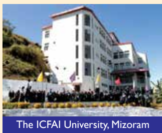
The ICFAI University, Mizoram