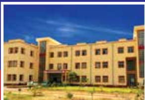
The ICFAI University, Raipur