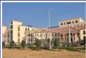
The ICFAI University, Jaipur