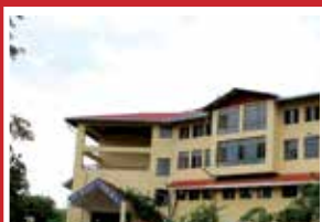
The ICFAI University, Meghalaya