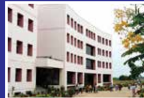
The ICFAI University, Tripura