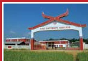
The ICFAI University, Nagaland