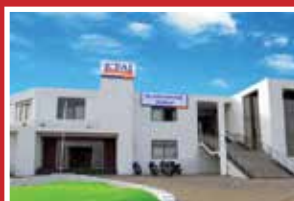
The ICFAI University, Jharkhand