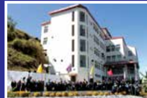
The ICFAI University, Mizoram