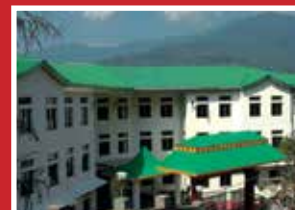
The ICFAI University, Sikkim