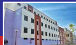
The ICFAI University, Himachal Pradesh (Baddi)