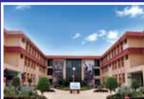
The ICFAI University, Dehradun

ICFAI has established 11 Universities across India. The ICFAI Universities are located at Hyderabad [The ICFAI Foundation for Higher Education (IFHE), which is a Deemed-to-be University], Dehradun, Himachal Pradesh (Baddi), Jaipur, Jharkhand, Meghalaya, Mizoram, Nagaland, Raipur, Sikkim and Tripura.