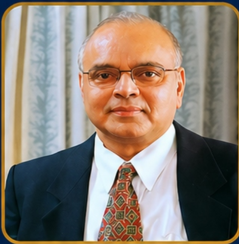
THE MAN WHO SAW TOMORROW

“ For some are born to do great deeds, and live, As some are born to be obscured, and die ”