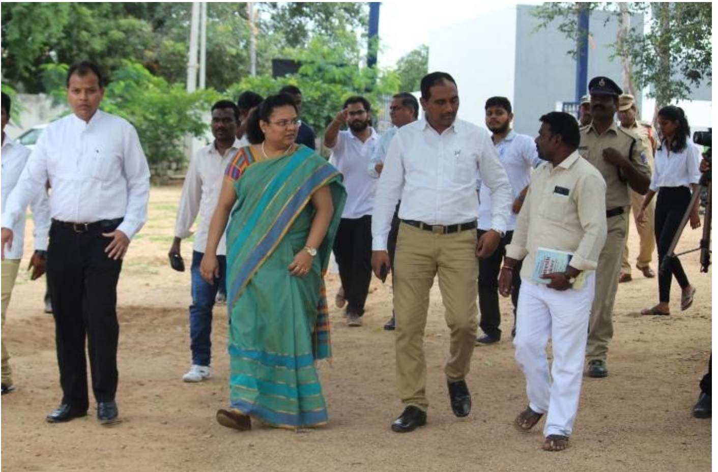
Dignitaries with Students during the event hosted by the Legal Aid Centre.