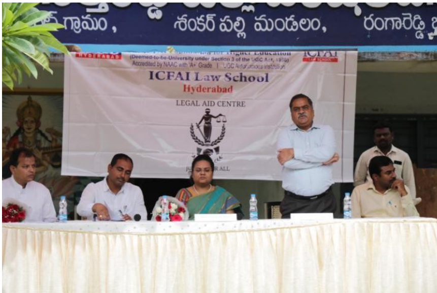
An event organized by the Legal Aid Centre of the ICFAI Law School. It focused on enhancing the knowledge of people on how sticking to the system would be helpful.

Venugopal is one of the main advocates for judicial reforms in India. He is against the creation of regional benches of the Supreme Court of India. Instead, he recommends that Courts of Appeal be established in the four regions of the country, who finally decide on appeals from the High Court judgments in all cases other than cases of national importance which affect the whole country, disputes between States or between States and the Centre, Presidential references and substantial questions of law relating to interpretation of the Constitution. This will relieve the burden on Supreme Court.