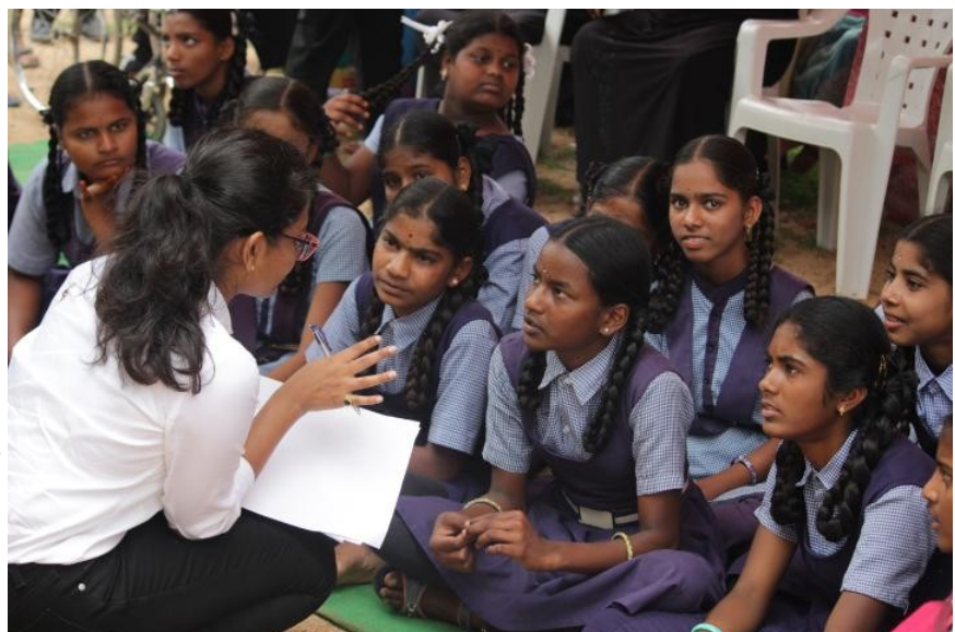
A student explaining with regards to the help legal aid centers provide to the people.