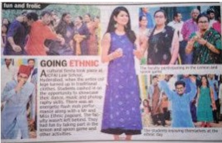
Ethnic Day held in ICAFAI Law School being highlighted by a leading newspaper in the city.