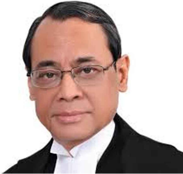
Shri Ranjan Gogoi