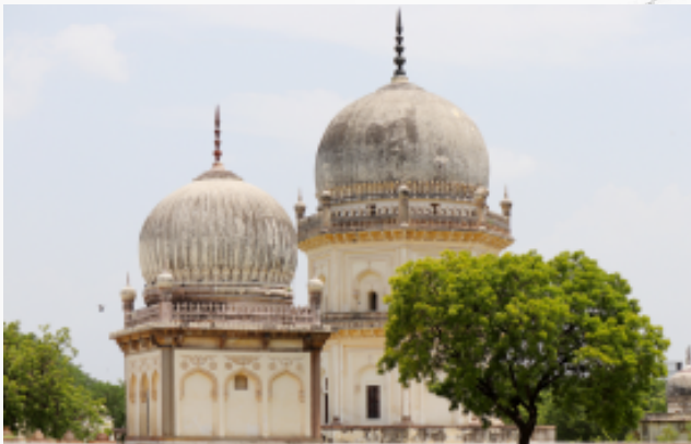
Qutub Shahi Tombs