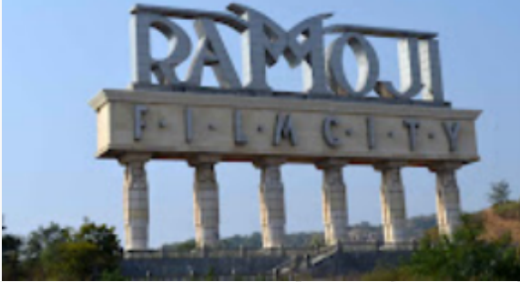
Ramoji Film City