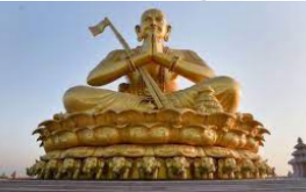
Statue of Equality