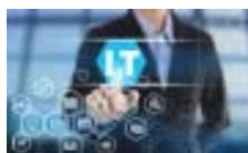
INFORMATION TECHNOLOGY & OPERATIONS