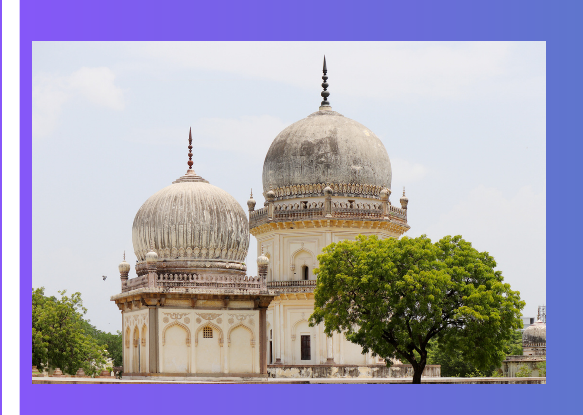
Qutb Shahi Tombs