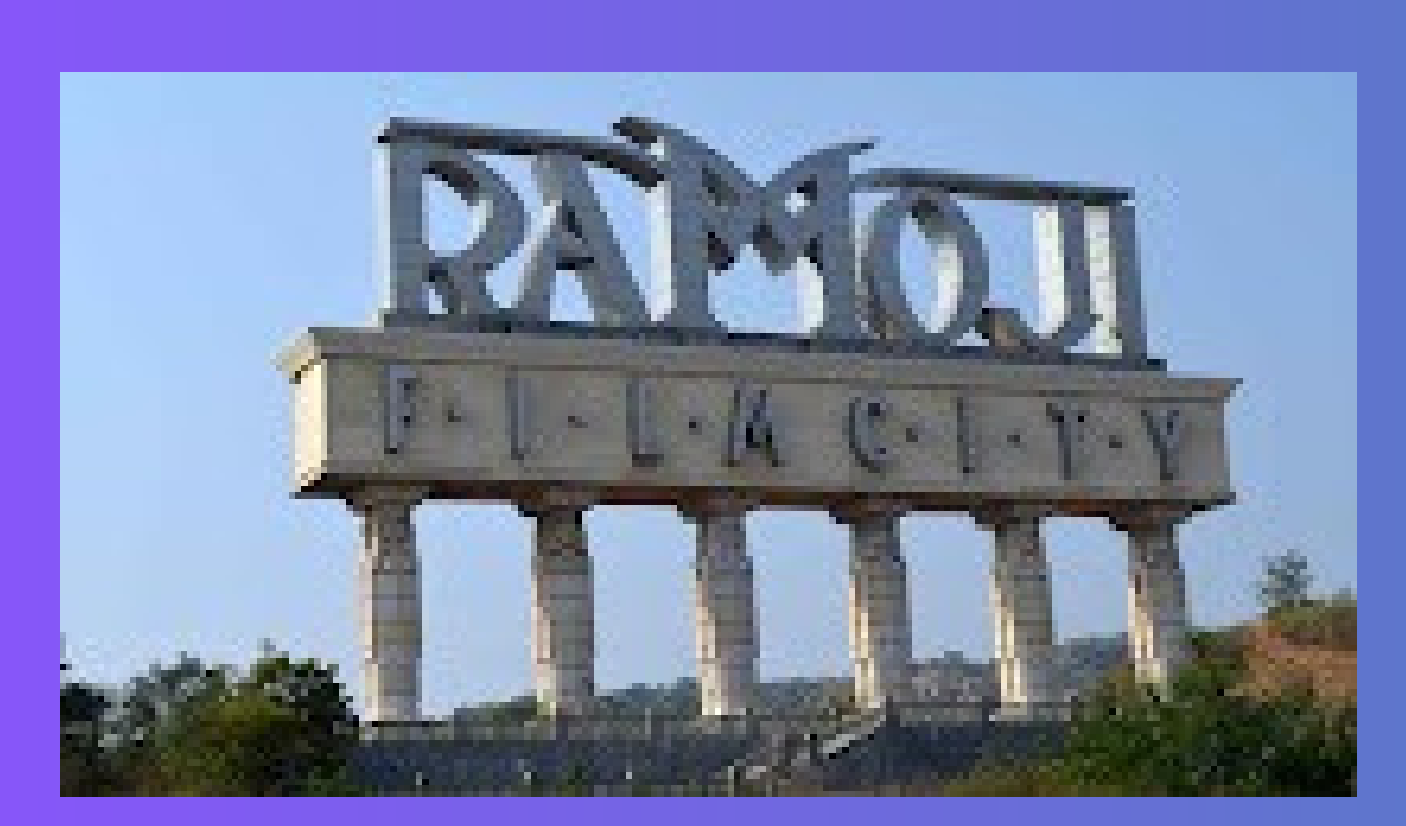
Ramoji Film City