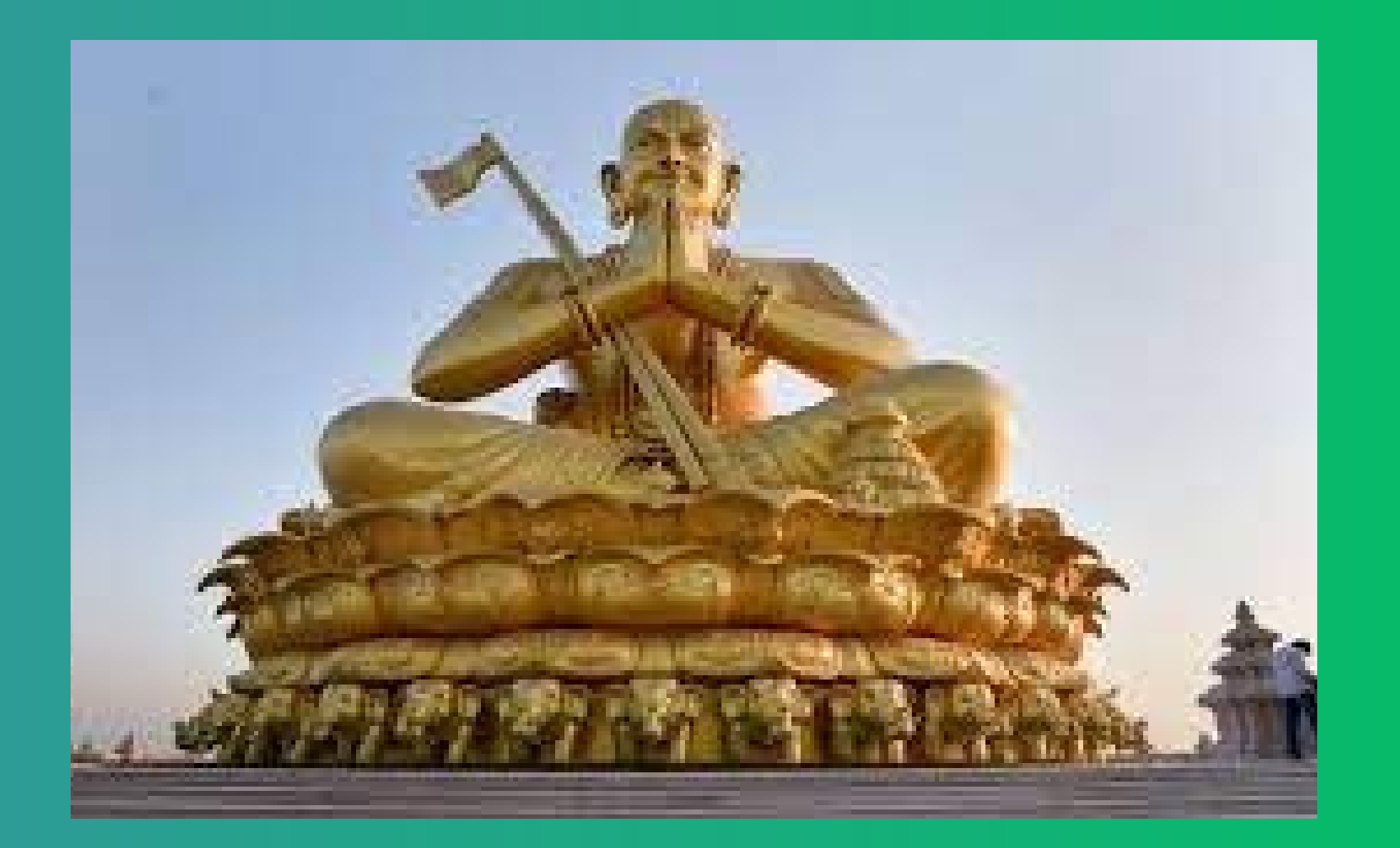
Statue of Equality