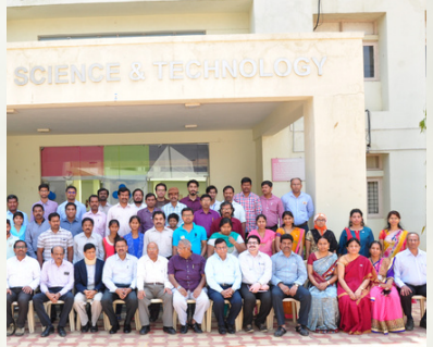
Faculty/ Student Achievement